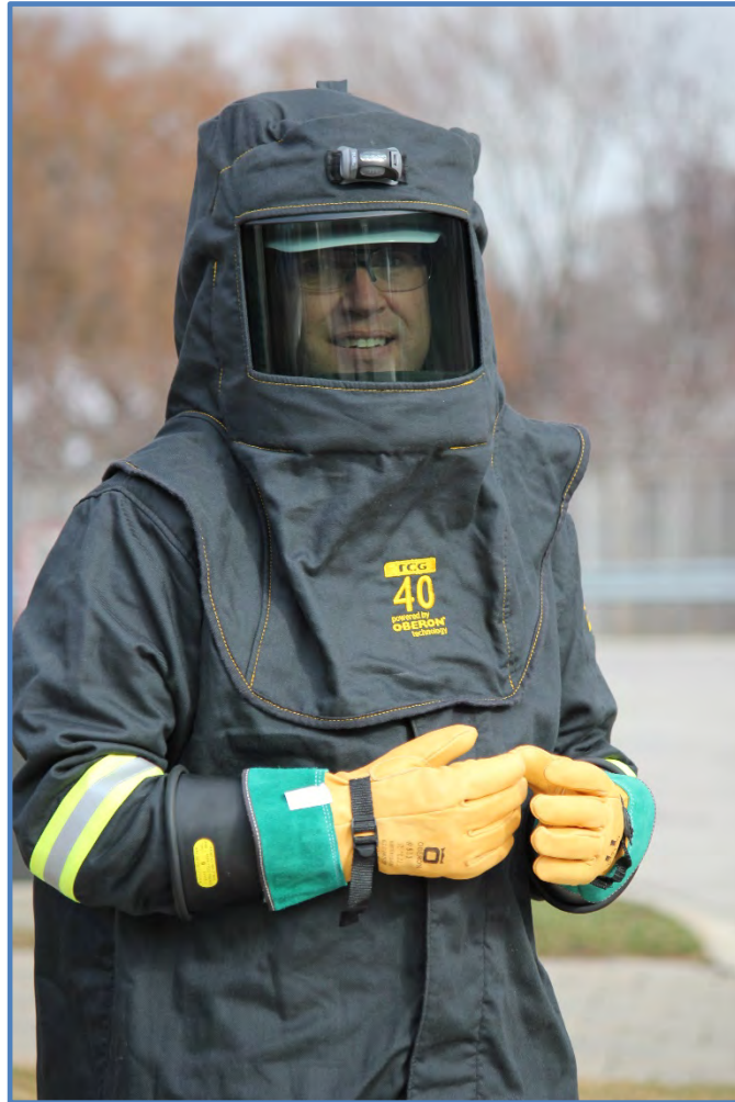
Oberon's TCG Series Arc Flash Suits